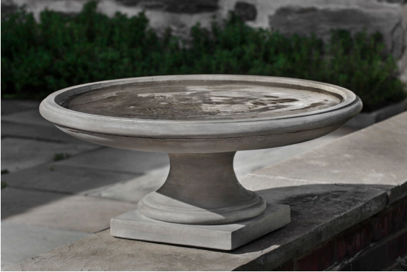
Shown in Greystone