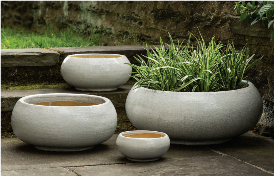
Shown in Antique Pearl