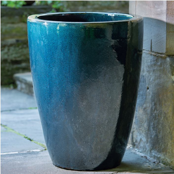
Shown in Indigo Rain