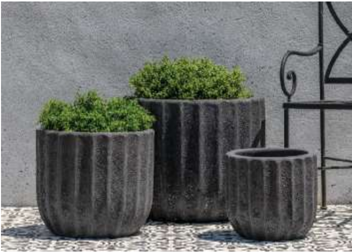
Maris Planters shown in Volcanic Coral