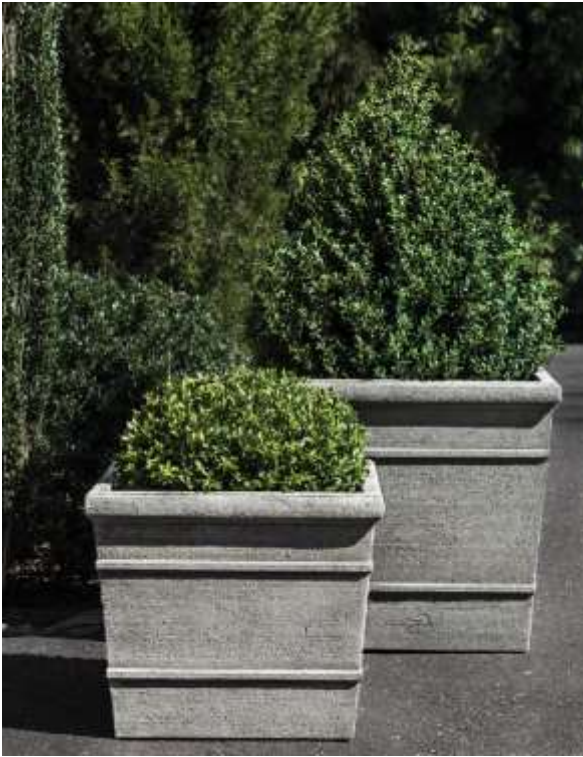
Shown in Greystone