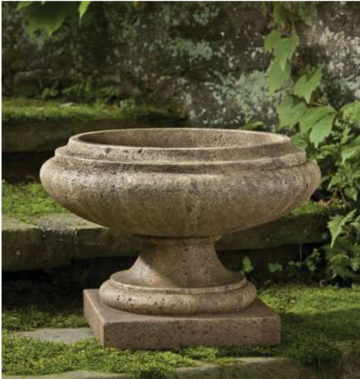
Shown in Aged Limestone