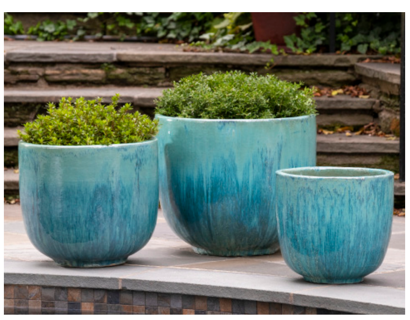
Shown in Antigua