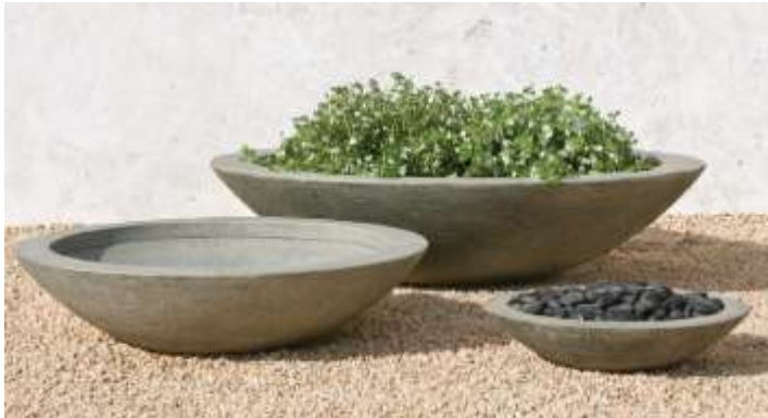
Shown in Alpine Stone

Campania proudly manufactures its cast stone products in the USA using locally sourced materials. All of our cast stone pieces are manufactured using the wet casting technique with a proprietary high density cast stone mix, yielding a PSI strength of approximately 7,500. The mix is comprised primarily of water, sand, stone aggregate and cement. Our cast stone products may qualify for LEED credits as applicable to your project. Cast stone produces a strong and durable product that will weather naturally in an outdoor environment. Simply stated, cast stone is chosen for its beauty and authenticity. Our material is natural, authentic, made in the USA, and 100% recyclable. These planters are often specified for hospitality projects, large scale public space installations, pedestrian and traffic safety, and other custom projects. Although we recommend that you take advantage of the quick turnaround of our stocked product; these shapes, finishes, and/or sizes are not always right for every job. Campania has the capability to produce custom molds and colors in our Pennsburg, PA factory.