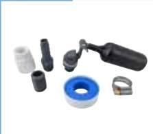
Auto Fill Kit #ABDAUTO