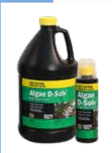
Algae D-Solv® #PB2002

If you need replacement parts please contact us directly at 800-975-4022 or email us at support@theblissfulplace.com