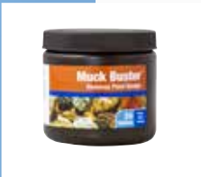
Muck Buster® #PB2682