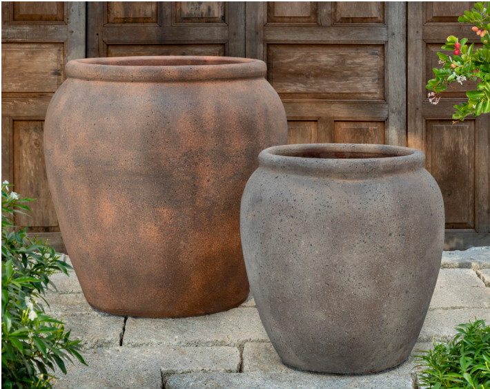
Shown in Sandblasted

Traditional terra cotta planters are given added textural interest with a sandblasting technique. Color tones range from buff to burnt sienna. Campania's glazed and terra cotta planters are hand made from natural clay using traditional artisanal techniques and high-fired at temperatures between 990-1000 degrees centigrade to ensure frost resistance and durability. Please note that actual colors may vary slightly from those depicted here.