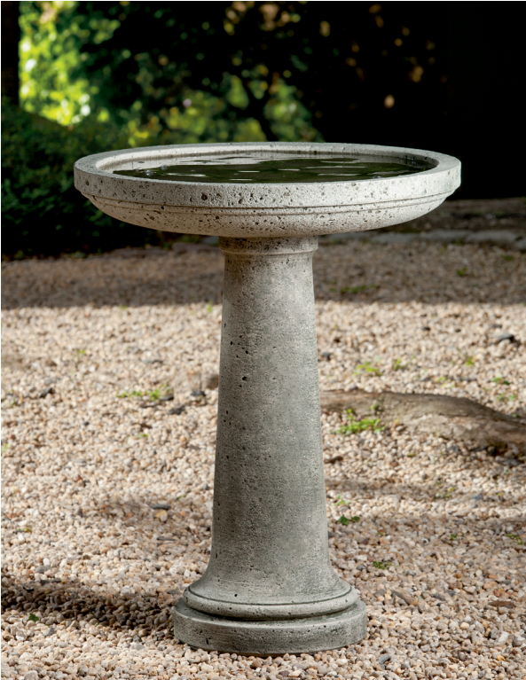
Shown in Alpine Stone