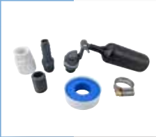
Auto Fill Kit #ABDAUTO