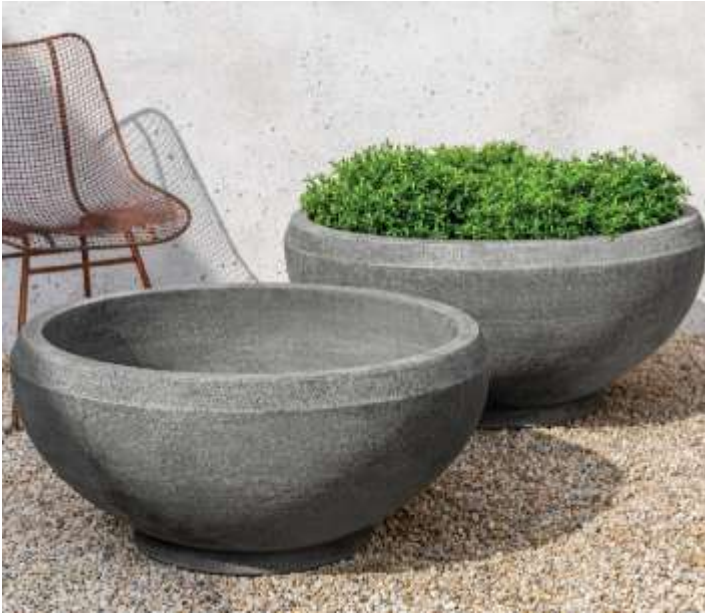
Shown in Alpine Stone