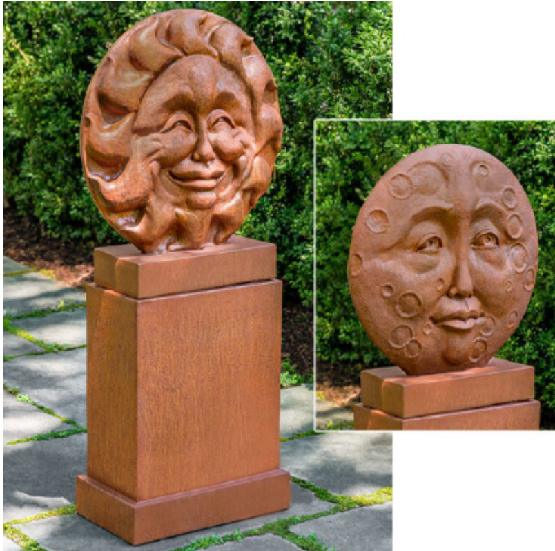
Shown in Ferro Rustico Nuovo