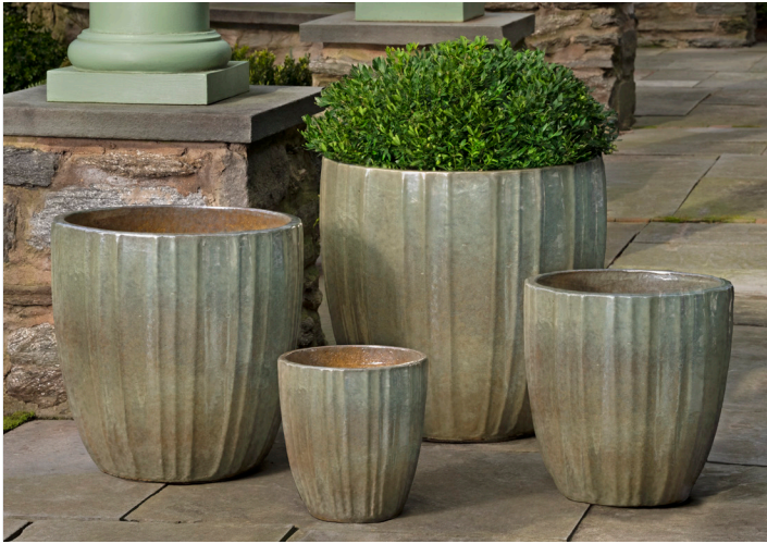
Shown in Crystal Green