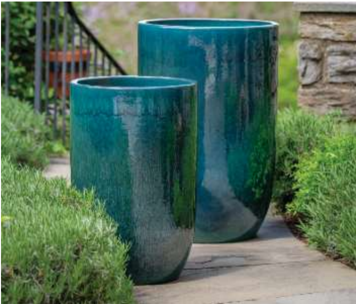
Shown in Indigo Rain