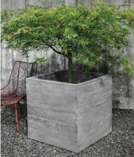
Shown in Greystone

Available in a choice of thirteen (13) exclusive natural pigment stains in addition to natural. All of our patinas are hand applied in a multi-step process which produces unique and beautiful surface finishes. Designed to replicate the look of naturally aged materials, the patinas will not prevent the natural aging process that occurs in an outdoor environment. Rather than creating uniform stains, our approach gives our products their unique beauty and appeal.