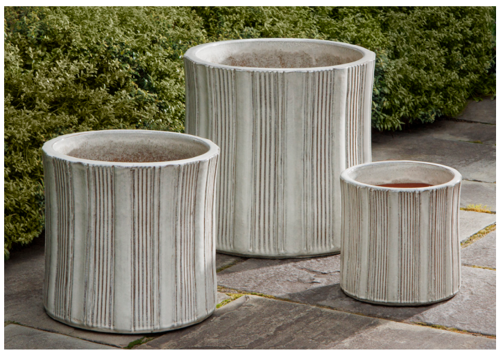
Shown in Cream