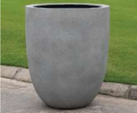
Shown in Stone Grey