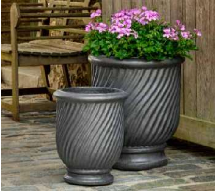
Shown in Graphite