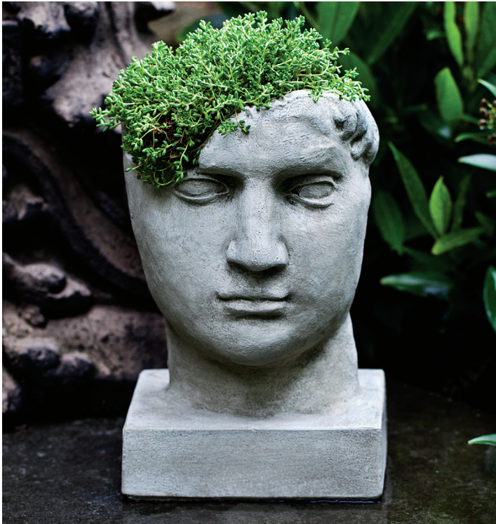
Shown in Alpine Stone