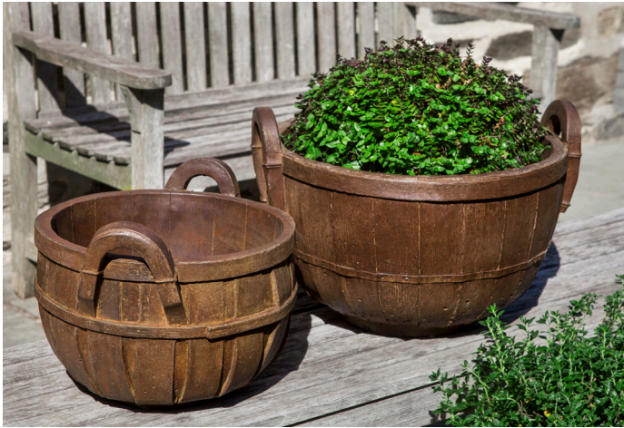
Shown in Pietra Nuova

Campania proudly manufactures its cast stone products in the USA using locally sourced materials. All of our cast stone pieces are manufactured using the wet casting technique with a proprietary high density cast stone mix, yielding a PSI strength of approximately 7,500. The mix is comprised primarily of water, sand, stone aggregate and cement. Our cast stone products may qualify for LEED credits as applicable to your project. Cast stone produces a strong and durable product that will weather naturally in an outdoor environment. Simply stated, cast stone is chosen for its beauty and authenticity. Our material is natural, authentic, made in the USA, and 100% recyclable. These planters are often specified for hospitality projects, large scale public space installations, pedestrian and traffic safety, and other custom projects. Although we recommend that you take advantage of the quick turnaround of our stocked product; these shapes, finishes, and/or sizes are not always right for every job. Campania has the capability to produce custom molds and colors in our Pennsylvania, PA factory.