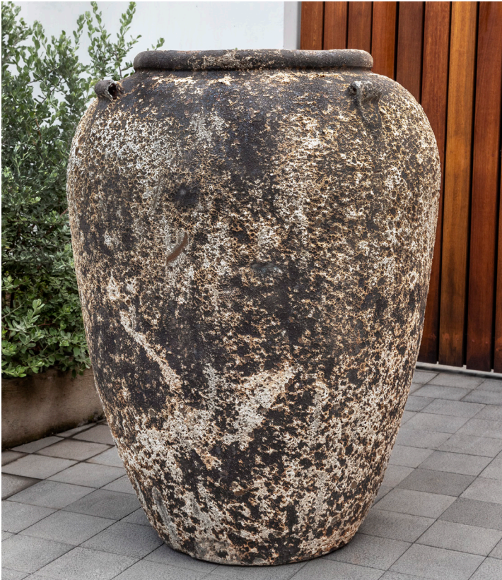
Shown in Aegean