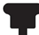
MUSHROOM TOP RAILINGS