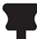
IRREGULAR SHAPED RAILINGS