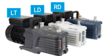
Vector LD and LT also available for laboratory applications