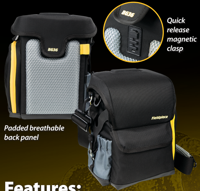
Padded breathable back panel