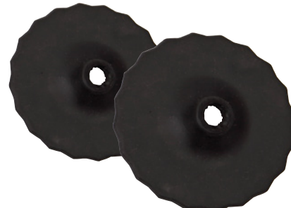
Soft Gel Bit Guards Easy to fit, offer a soft alternative to traditional bit guard designs. 132532

Designed to help prevent chafing of the horse's chin. 132530