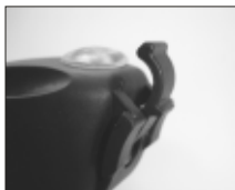
Headlamp mount with release lever

Insert the headlamp mount into the handlebar or helmet mount slider clip from the rear of the slider clip forward. Gently rocking the lamp as you slide it may help. Do not push the release lever when inserting the headlamp into the slider clip; let the lamp snap into place by itself.