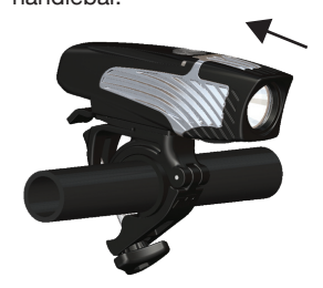
Once the handlebar mount is securely mounted, slide the headlamp into place.

Swing the hinge down to make contact with the handlebar. Swing the hex bolt up, seating the knob into its recess. Turn the knob clockwise to tighten and secure the mount to the handlebar.