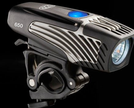
Lumina: 350, 500, 650