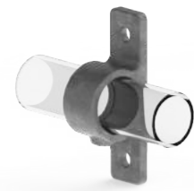
DOUBLE COLLAR PLATE