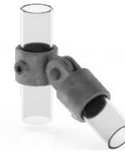
SINGLE SWIVEL COMBO