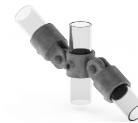
DOUBLE SWIVEL COMBO