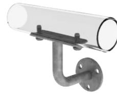
WALL SUPPORT SADDLE