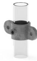
MALE DOUBLE SWIVEL