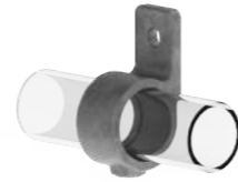
SINGLE COLLAR PLATE