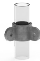
MALE CORNER SWIVEL