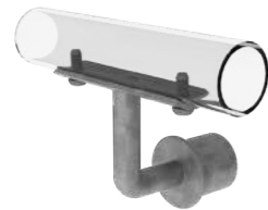
SWIVEL SUPPORT SADDLE

*Notes : made to order straight or raking