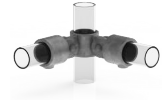
CORNER SWIVEL COMBO