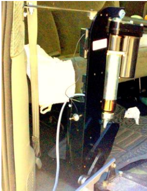
Actuator Bracket & C-Pillar Bracket on upper part of bracket to van pillar.