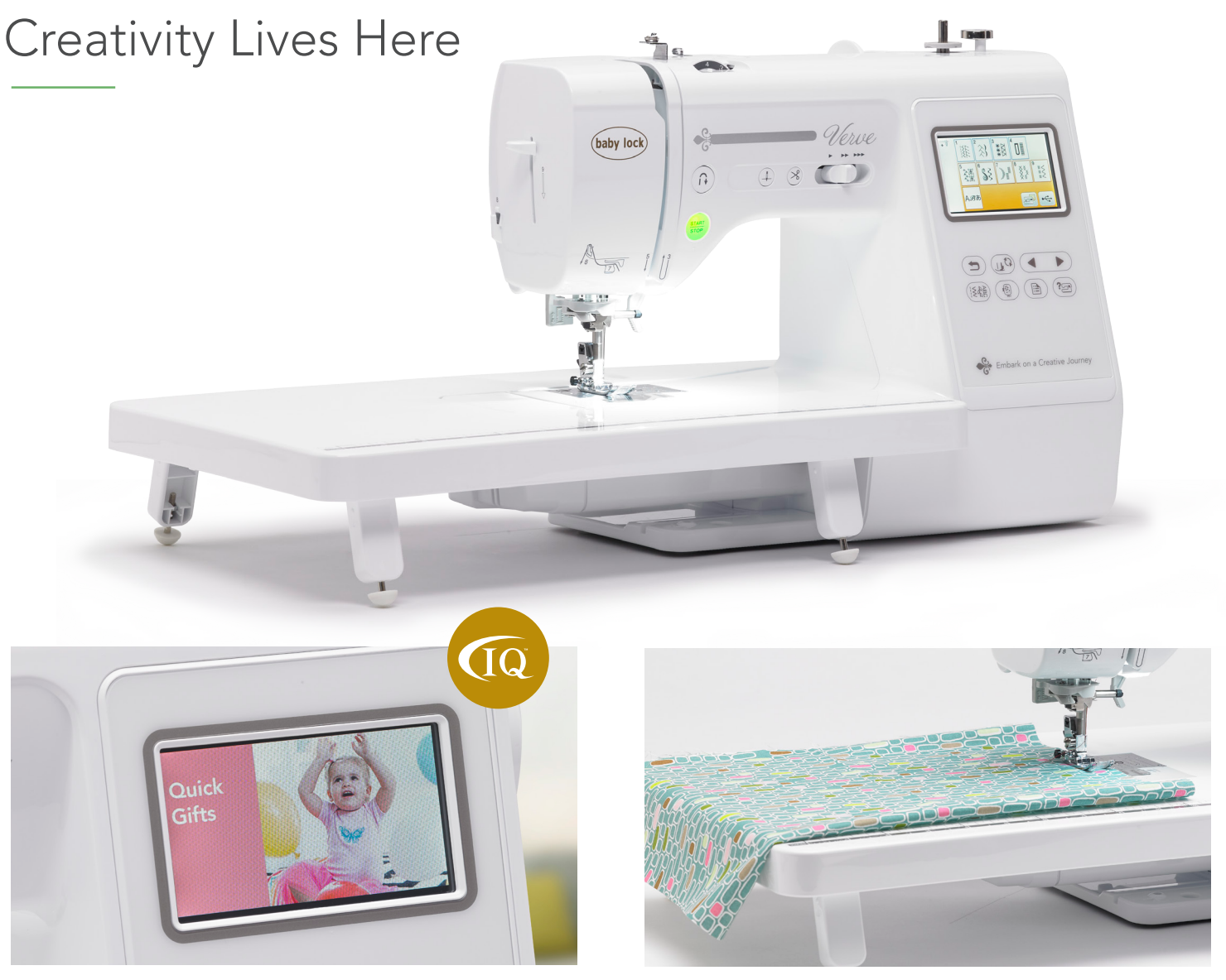
Large Color LCD Screen - 3.2" x 1.8"

Easy-to-read touchscreen makes it a snap to quickly access your machine's settings, designs and editing tools.