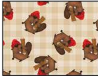
Tossed Beavers - Beige 9267-33