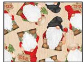
Gnomes on Woodgrain - Beige 9274-48