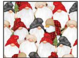
Stacked Gnomes - Multi 9271-89