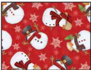
Tossed Snowmen - Red 9272-88