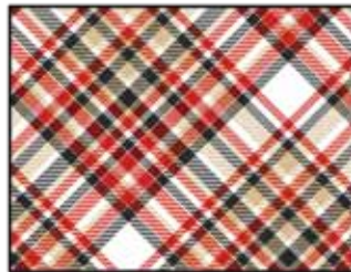
Bias Plaid - Multi 9276-89