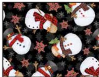
Tossed Snowmen - Black 9272-99