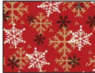
Snowflake - Red 9268-88