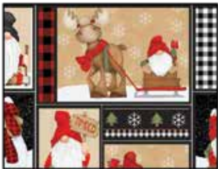
Gnomes Patchwork - Multi 9269-89