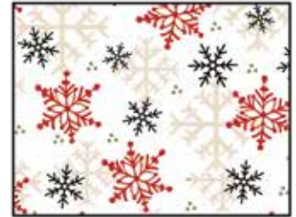
Snowflake - White 9268-89