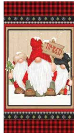
Gnome Panel - Red/Black 9277P-89