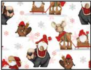
Woodland Character Allover White – 9266-89