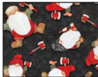
Tossed Gnomes - Black 9273-99