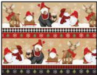
Novelty Gnome Stripe - Multi 9275-89