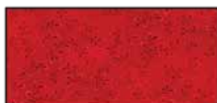
Red Hot 7755-81