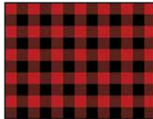
Buffalo Check - Red/Black 9270-89