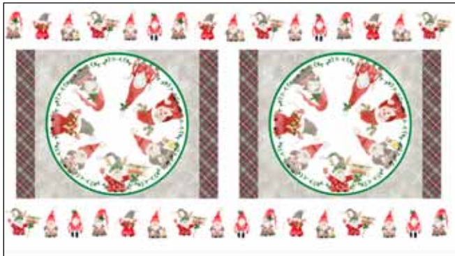
GHTF 4704 MU*