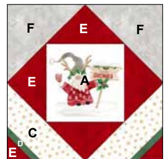
Figure 1 Make 4. 18 1/2" x 18 1/2" unfinished.