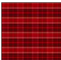
GHTF 4710 R