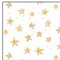
GHTF 4707 W*