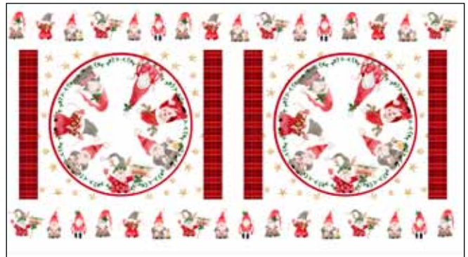
GHTF 4704 R