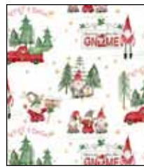
GHTF 4706 MU†