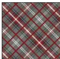
GHTF 4711 MU