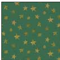
GHTF 4707 G