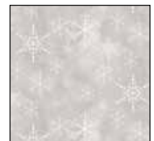
GHTF 4709 S*