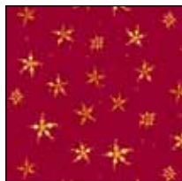
GHTF 4707 R