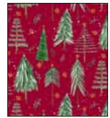
GHTF 4708 R†