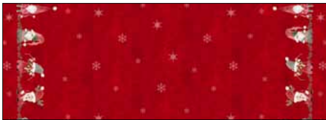
GHTF 4712 MU