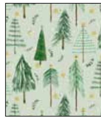
GHTF 4708 G