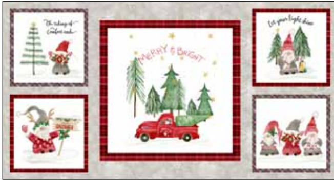
GHTF 4703 PA*