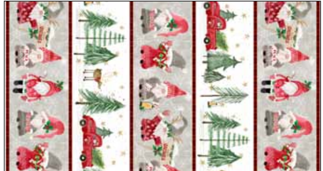
GHTF 4705 MU