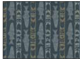
LESC 4520 DB*