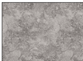
SERE 4492 SS*