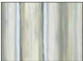
LESC 4521 MU