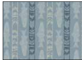
LESC 4520 B