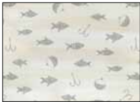
LESC 4519 MU†