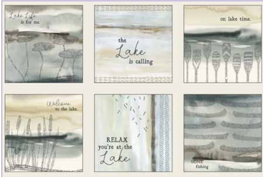
LESC 4517 PA

Fabric Collection by Jetty Home for P&B Textiles