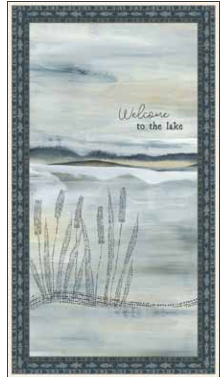
LESC 4518 PA*