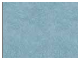
SERE 4492 TB*