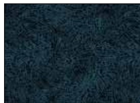
SERE 4492 DB*