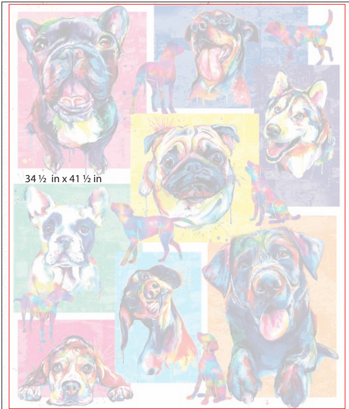
Large Panel – 19142-PNL-CTN-D 1 yd x wof (91.44 cm x 106.68 cm) Fussy Cut 1 – 34 ½ in x 41 ½ in (87.63 cm x 105.41 cm)

Use a rotary cutter and ruler to cut the size and number of rectangles from each fabric listed below.