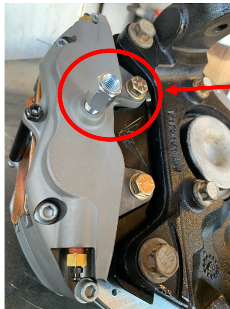
banjo bolt adapter

Before working with the vehicle, install the provided banjo bolt adapters into the Wilwood calipers. Make sure they are tight.