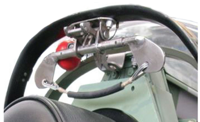
Add pull handle from fine wire. Simulate rubber with thick black paint. Add ball from epoxy blob.