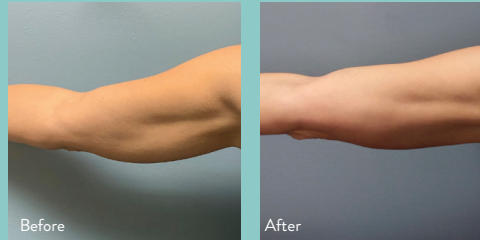
Dr. D. Kiba

For patients wanting to turn back the hands of time without any further disruptions to their daily activities, EvolveX treatments are ideal - there is no surgery, no anaesthesia, no scars, and no downtime. You can return to your regular routine immediately after these total body procedures.