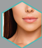
FACE / NECK