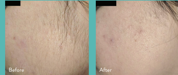
5 Treatments - Stephen Mulholland, MD