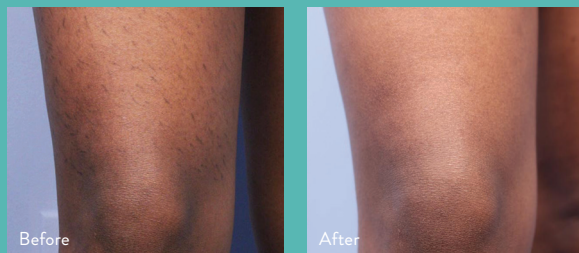
5 Treatments - Stephen Mulholland, MD