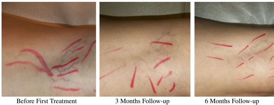
FIGURE 7 A sample case demonstrating 3- and 6-mo follow-up results. Before (left), at 3-mo follow-up (middle) and at 6-mo follow-up (right)