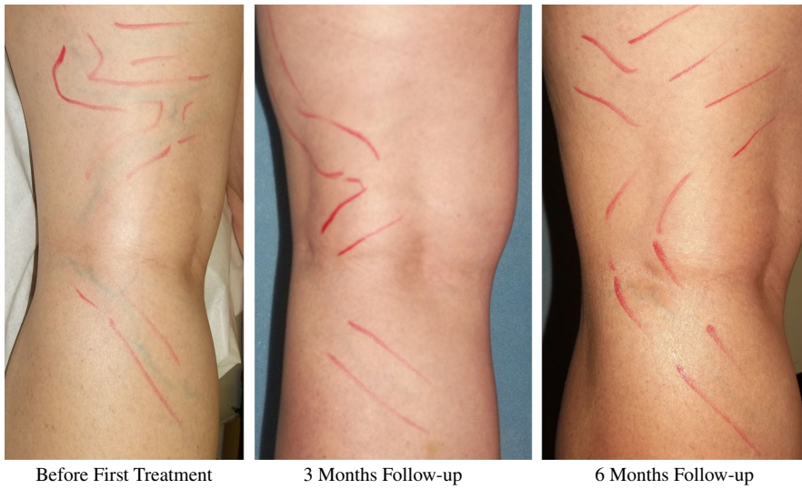
FIGURE 6 A sample case demonstrating 3- and 6-mo follow-up results. Before (left), at 3-mo follow-up (middle) and at 6-mo follow-up (right)