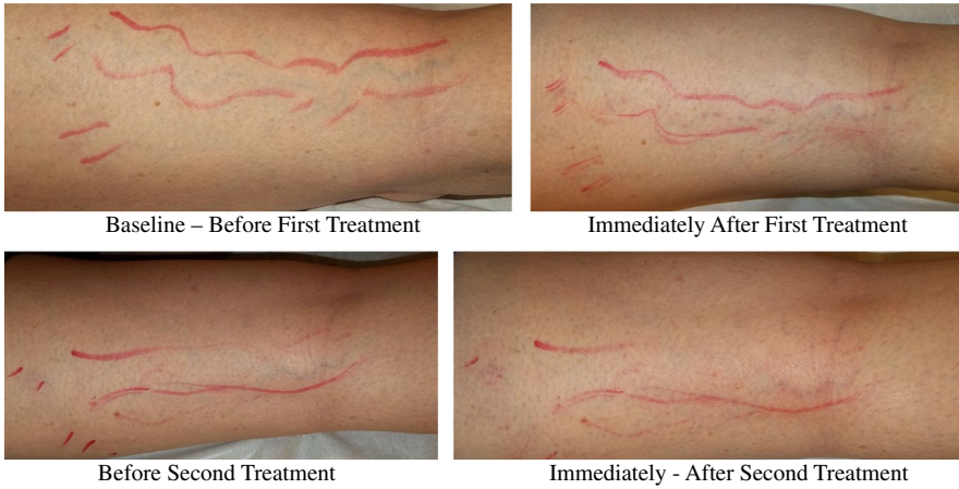
FIGURE 4 A sample case demonstrating immediate treatment results. Before (up, left) and immediately after first treatment (up, right) and before (bottom, left) and immediately after second treatment (bottom, right)