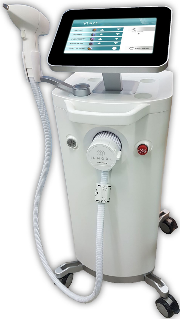
FIGURE 1 InMode Vasculaze Device

was to evaluate the safety and efficacy of Vasculaze 1064 nm diode laser applicator for the treatment of lower extremity leg and spider veins.