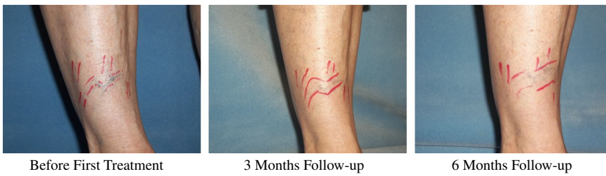
FIGURE 5 A sample case (same patient as in Figure 3) demonstrating 3- and 6-mo follow-up results. Before (left), at 3-mo follow-up (middle) and at 6-mo follow-up (right)