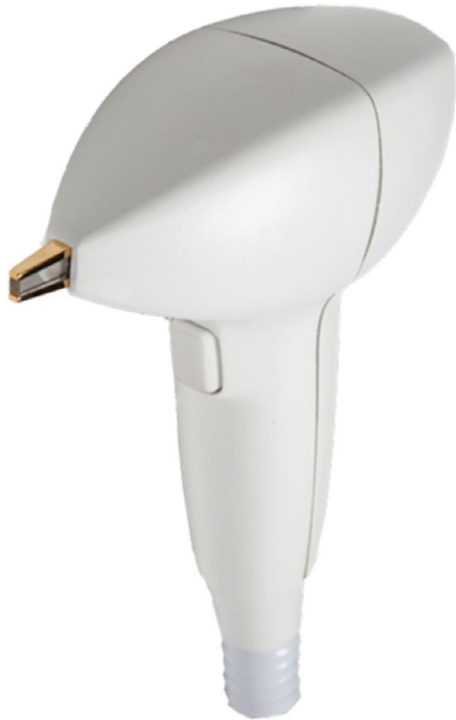
FIGURE 2 InMode Vasculaze Handpiece

Safety was evaluated by observation and assessment of subjects' reaction every visit after each treatment and at follow-up visits. Any minor or major adverse events were recorded.