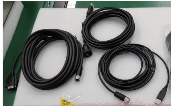
VGA cable/ HDMI cable/ USB cable