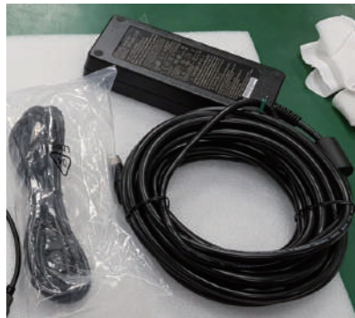
Power cord/ Power adapter with waterproof caconnector