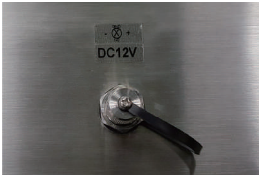
Waterproof Power Connector