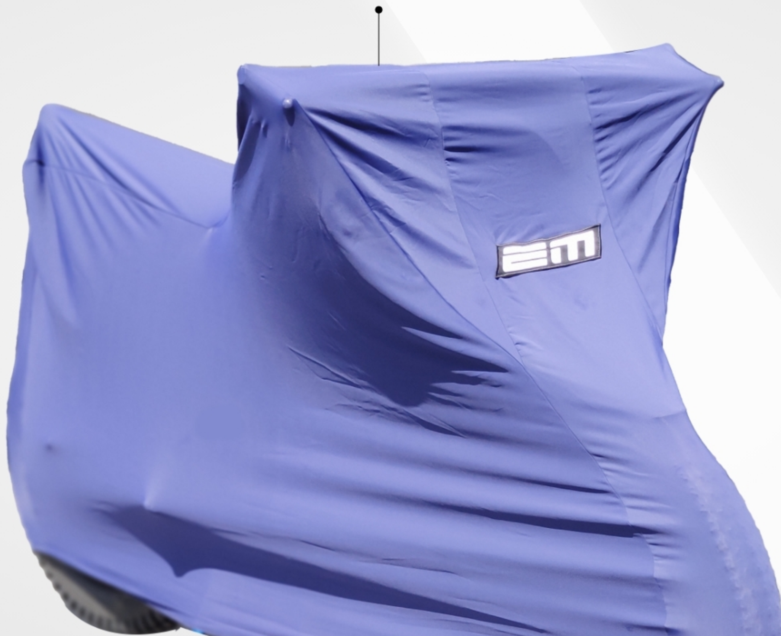
EM BIKE COVER