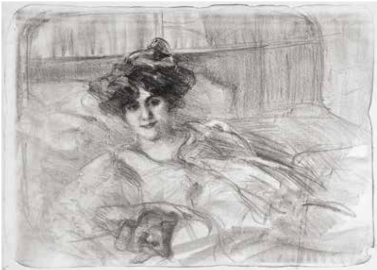
73. Femme au Lit Convalescence (Woman on a bed convalescing), Julie de Belleroche. Lithograph. 1911. Unsigned. 10 1/2 x 14 3/4 inches. [49324c]