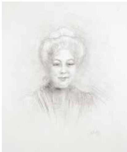
15. Lady Battersea . Lithograph. Initialed. Signed. 9 x 7 1/2 inches. [50250c]