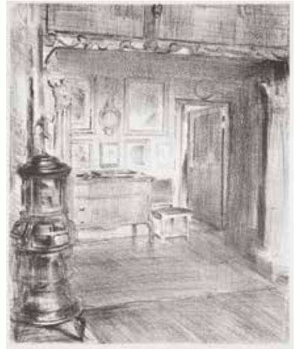
85. Dans L'Atelier (Studio), Glencairn (Scotland) . Lithograph. 1913. Initialed. 14 1/2 x 11 3/4 inches. [49401c]