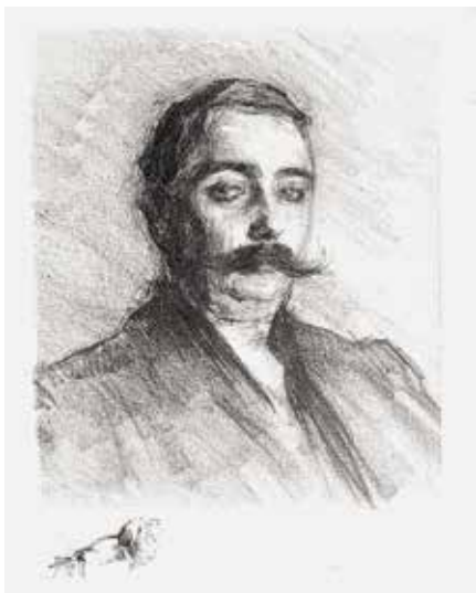
38. Duchalel. Lithograph, with remarque lower left. Unsigned. 8 1/4 x 7 inches. [50165c]