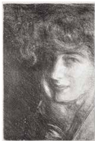
57. Femme gros plan (Woman up close). Lithograph. Signed. 13 3/4 x 9 inches. [49575c]