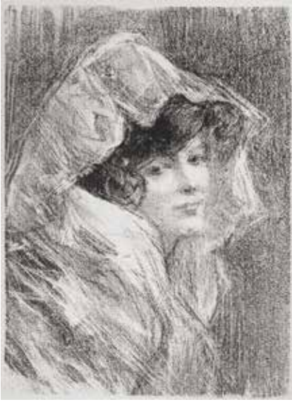
10. Petite Tete Mantille (Little lace head scarf), Invitation, Nana. Lithograph. 1904. Signed. 5 x 3 1/2 inches. [49481c]