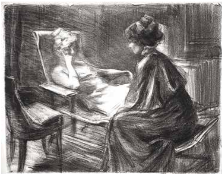
113. Divine a la Chaise Lounge. Lithograph. Signed. 18 1/2 x 23 1/2 inches. [48746c]