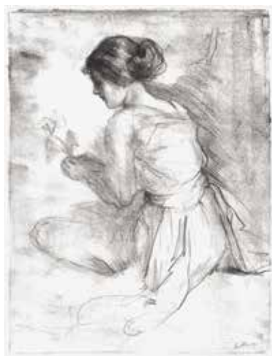
107. La fille a la Fleur (Girl with flower) . Lithograph. 1914. Signed. 10 3/4 x 8 inches. [49308c]