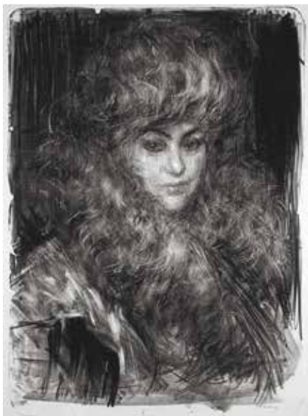
34. Le Boa , Alice Milbank. Lithograph. 1906. Signed. 24 3/4 x 17 3/4 inches. [48725c]