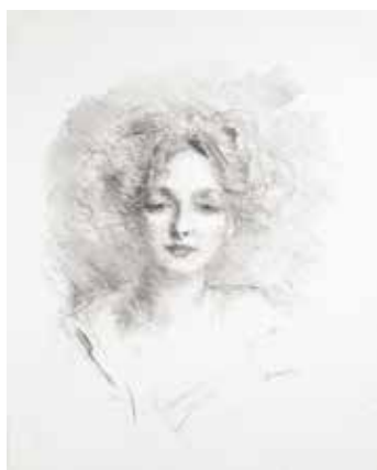
67. Marthe . Lithograph. 1908. Signed. 9 1/2 x 8 inches. [50390c]