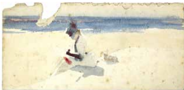
66. Inscription on back: by Albert de Belleruche French Beach. Watercolor. 3 1/2 x 7 inches. [49906c]