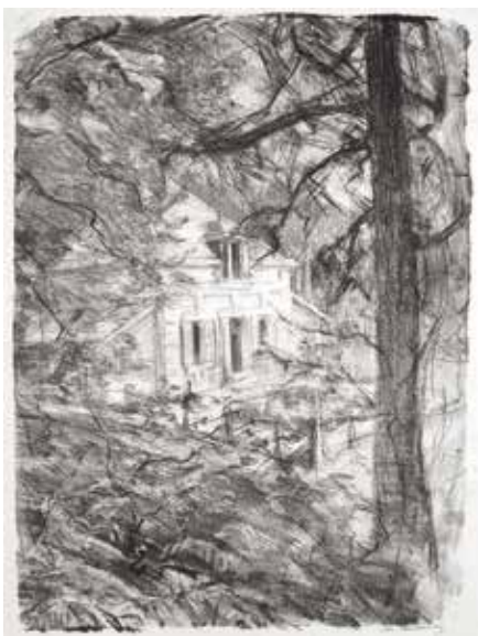
36. Poste St. Hubert a Travers les Arbres (St. Hubert Post Office, through the trees). Lithograph. 1907. Signed. 13 x 18 inches. [48660c]