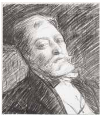
32. Sir Paolo Tosti, Composer. Lithograph. Signed. 9 1/4 x 8 inches. [49301c]