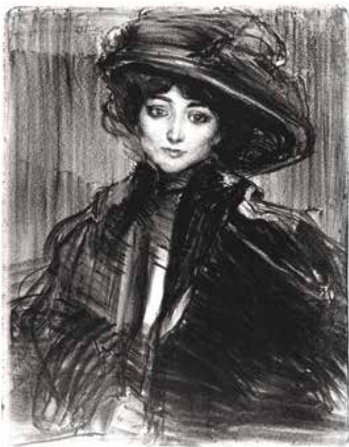
74. Léone. Lithograph. 1910. Signed. 27 1/2 x 21 1/4 inches. [48701c]