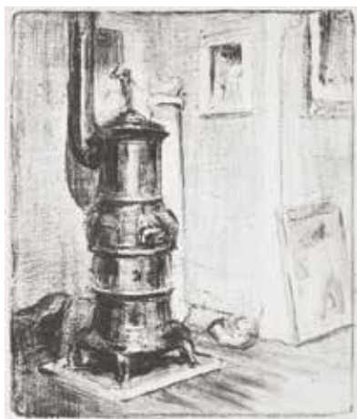
79. Study, Glencairn (Scotland) . Lithograph. 1914. Unsigned. 10 1/2 x 9 inches. [49333c]