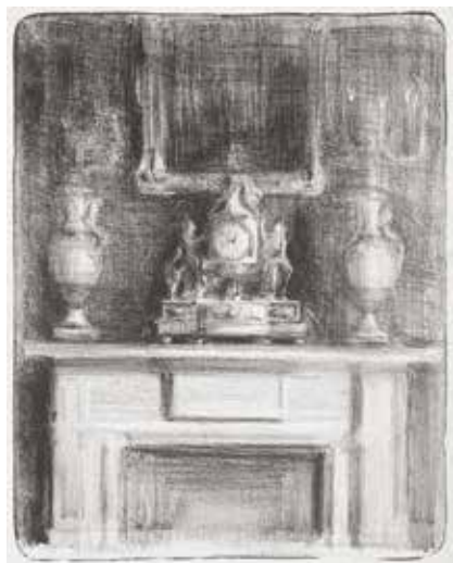
50. The Old Clock, Ferby Lodge. Lithograph. 1909. Signed. 10 1/4 x 14 1/2 inches. [49480c]