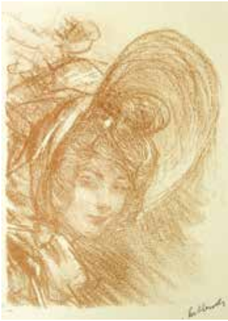
3. Petite Tete . Lithograph. 1901. Signed. 4 3/4 x 3 1/2 inches. [50192c]