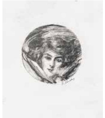
12b. Unidentified Sitter . Lithograph. Final version. 1902. Signed in pen. Tondo, 2 3/4 inches diameter.