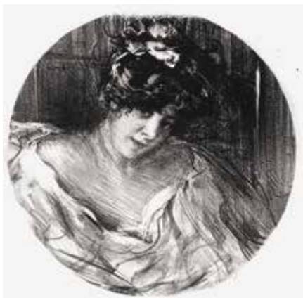
60. Le Reveil (waking), Julie de Belleroche. Lithograph. 1911. Signed. 11 3/4 x 12 inches. [49254c]