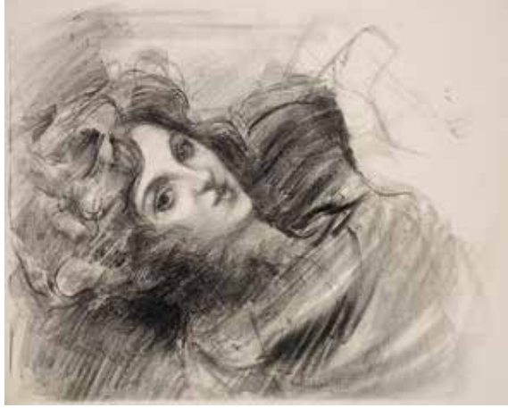
114. Miss Sablon, La Chanteuse (Singer) . Lithograph. 1908. Initialed. 20 1/2 x 16 1/2 inches. [48738c]