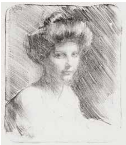
53. Unidentified Sitter. Lithograph. 1908. Initialed. 6 1/2 x 5 1/2 inches. [49444c]