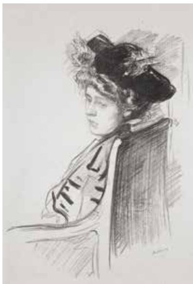
8. La toque noire . Lithograph. 1901. Signed. 14 x 10 inches. [49328c]