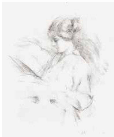
91. Unidentified Sitter. Lithograph. 1913. Initialed. 12 x 10 inches. [49245c]