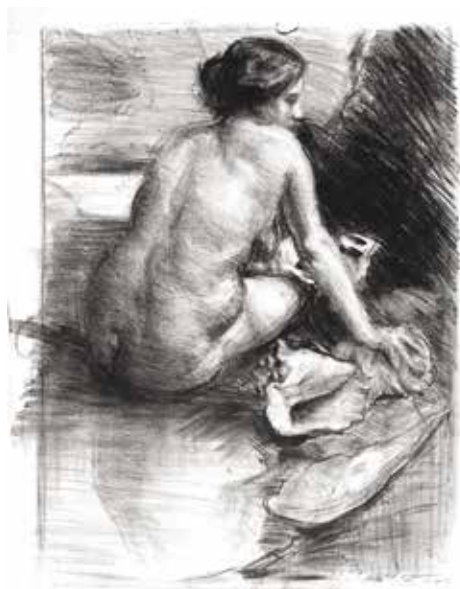
45. Femme au coquillage (Woman and shells). Lithograph. 1908. Edition of 30. Initialed. 22 1/2 x 17 1/2 inches. [48722c]