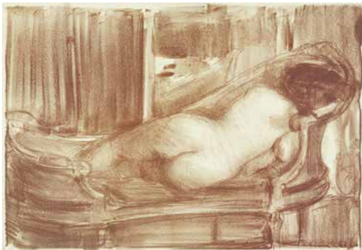
41. Madame Salvat, Nu Sur Canapé (Nude on a couch), Nude 7. Lithograph. 1907. Unsigned. 11 x 16 1/2 inches. [49287c]