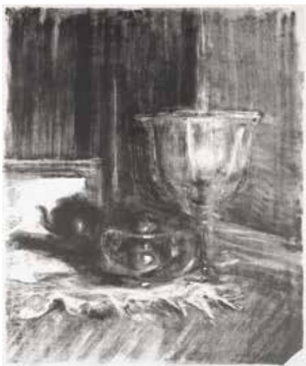
29. Nature Morte (Still Life). Lithograph. 1902. Signed. 11 1/4 x 9 1/4 inches. [49339c]