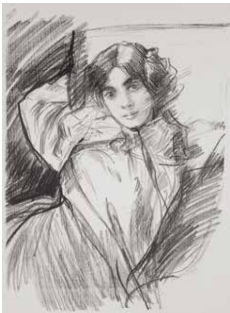
23. Unidentified Sitter. Lithograph. 1903. Signed. 13 1/2 x 10 inches. [49495c]