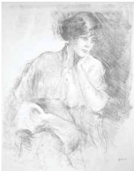
92. Pensive, Miss Charles. Lithograph. 1914. Signed. 16 x 10 3/4 inches. [49473c]