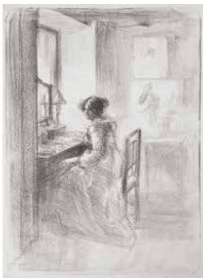
78. La Toilette, Julie de Belleruche . Lithograph. 1911. Initialed. 14 1/2 x 10 1/2 inches. [49551c]