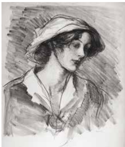
106. The Little Maid, Miss Spain Madelon . Lithograph. 1916. Signed. 22 x 18 1/2 inches. [48688c]