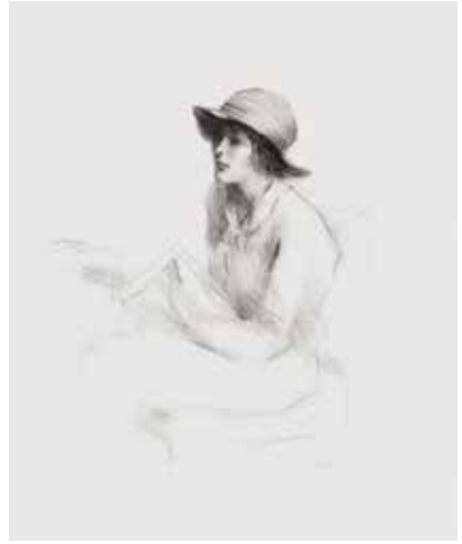
109. Petite Femme Assise (Young woman seated) . Lithograph. 1915. Initialed. 13 1/2 x 11 inches. [49569c]