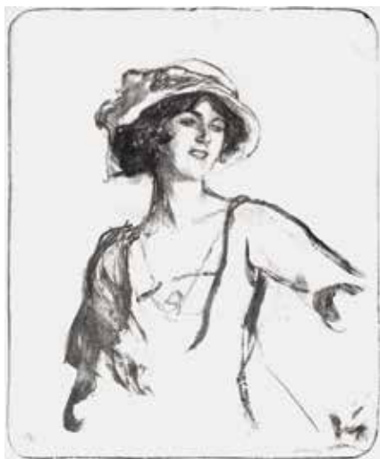
104. Rosamond . Lithograph. 1916. Signed. 12 3/4 x 10 1/2 inches. [49311c]