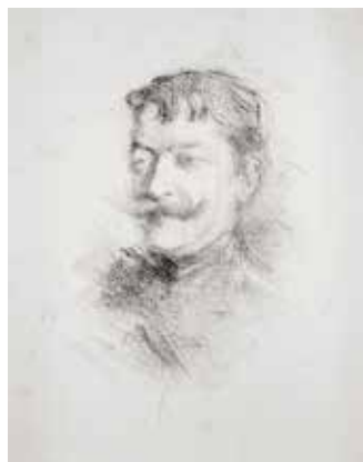
46. Le Normand . Lithograph. Signed. 8 x 5 inches. [49296c]