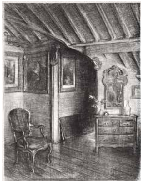
76. Coin d'Atelier (Corner of the studio). Lithograph. 1912. Unsigned. 21 1/2 x 16 3/4 inches. [48712c]