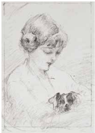
47. Alice de Belleruche. Lithograph. Initialed. 5 1/2 x 4 inches. [49288c]