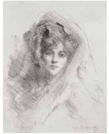
11. Unidentified Sitter . Lithograph. Signed. 10 x 7 inches. [50155c]