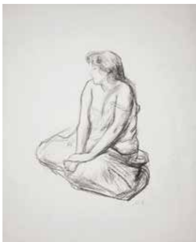
97. Unidentified Sitter. Lithograph. Initialed. 12 1/2 x 9 1/2 inches. [50750c]