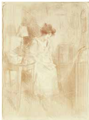
95. Julie de Belleroche. Lithograph, sepia. 1911. Signed. 14 1/2 x 10 1/2 inches. [49356c]