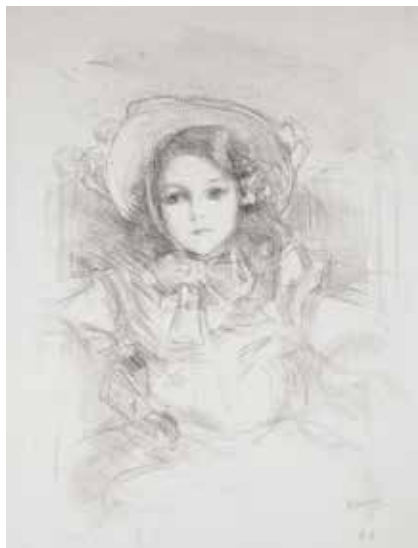
82. Therese, Madeline's sister. Lithograph. 1907. Signed. 15 1/2 x 11 inches. [49617c]