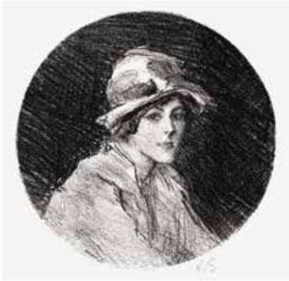
84. Petite Tête de Femme . Lithograph. 1913. Initialed. Tondo, 6 inches diameter. [49856c]