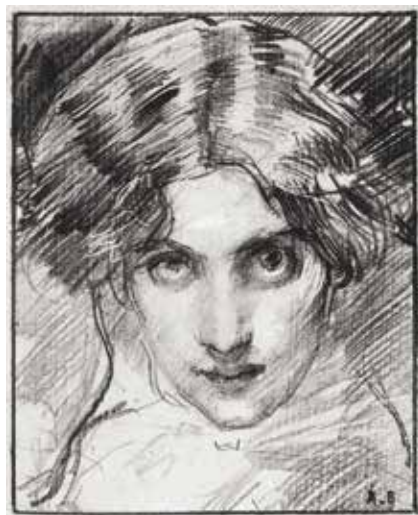
30. Rosa. Lithograph. 1905. Initialed in the stone. 6 3/4 x 5 1/2 inches. [49900c]