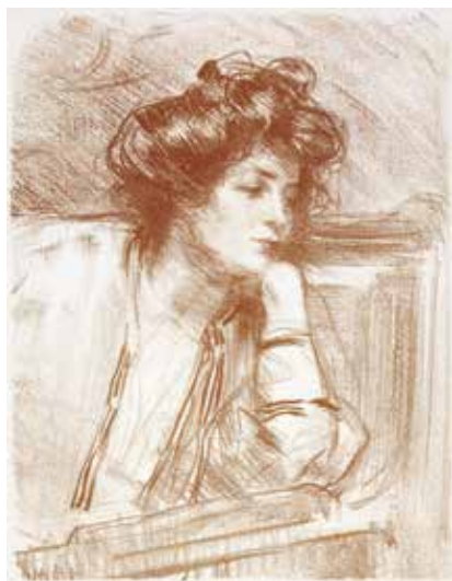
20. Songerie (Dreamer), Lili. Lithograph, sepia. 1903. Edition of 40. Signed. 12 x 9 1/8 inches. [50954c]