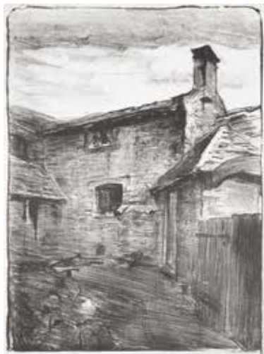
35. Corner of the house at Rustington . Lithograph. Initialed. 14 x 10 1/2 inches. [49431c]