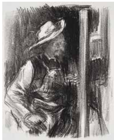
49. Charles Lucien Léandre, French cartoonist & painter. Lithograph. 1908. Unsigned. 16 x 12 inches. [48690c]