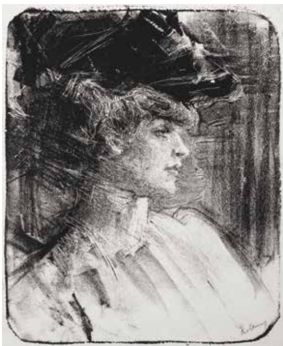
40. Divine de Profil (Side view of Divine). Lithograph. 1907. Signed. 6 1/4 x 5 1/4 inches. [49971c]