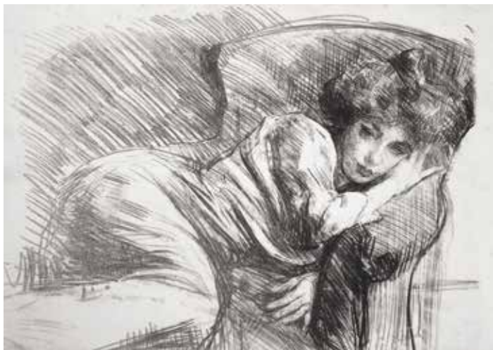
28. Unidentified Sitter. Lithograph. 1904. Signed. 11 x 15 inches. [49580c]