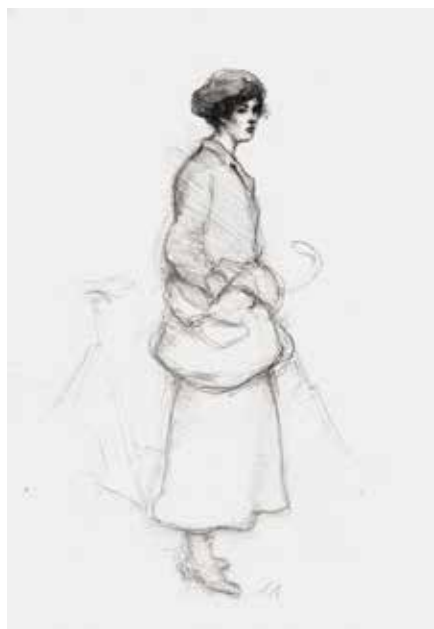
96. The Postwoman. Lithograph. 1914. Initialed. 15 x 10 inches. [50810c]