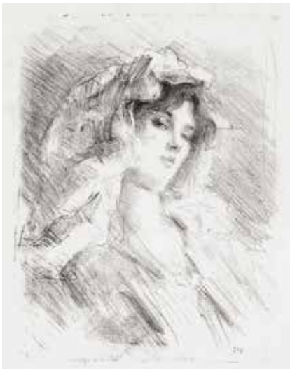
26. La Mantille (lace scarf), Petite Lili . Lithograph. 1907. Initialed. 6 1/2 x 5 inches. [50361c]