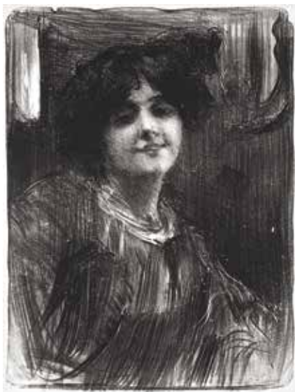
90. Juliette, Julie de Bellerocche. Lithograph. 1912. Signed. 23 1/2 x 17 1/2 inches. [48756c]