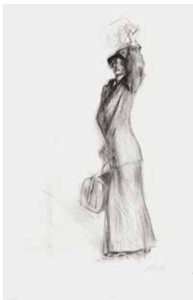
101. Goodbye. Lithograph. 1917. Initialed. 12 x 6 inches. [50360c]