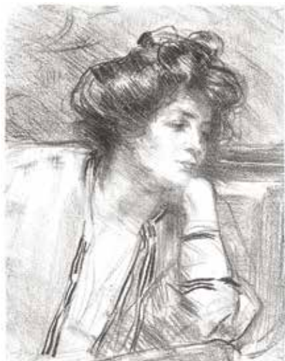
19. Songerie (Dreamer), Lili. Lithograph. 1903. Edition of 40. Signed. 10 1/4 x 8 inches. [50951c]