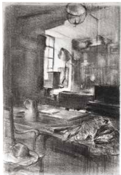
61. Interieur la Boissiere (Sawmill), Châteaudun (France). Lithograph. 1909. Unsigned. 21 x 14 1/2 inches. [48696c]