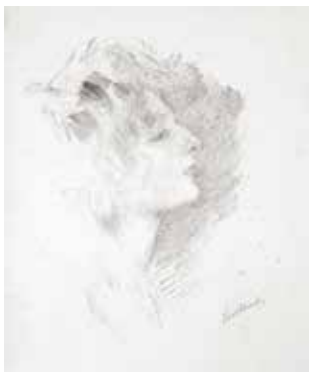
51. Marthe. Lithograph. 1907. Signed. 5 1/2 x 4 inches. [50144c]