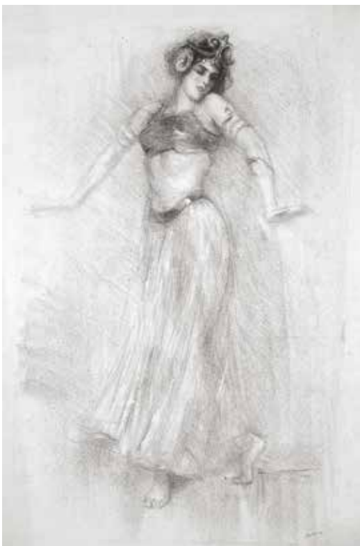
65. Danseuse, Sahri-Djellie, Dancer at the Follies Bergere and the Casino de Paris. Lithograph. 1909. Signed. 23 x 14 1/2 inches. [48624c]