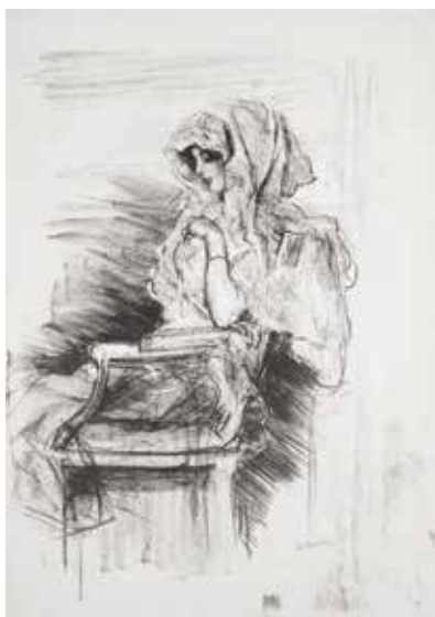
89. Petite Femme Accoudie, Mantille (Young woman with lace scarf leaning). Lithograph. 1913. Signed. 16 1/2 x 12 inches. [49300c]