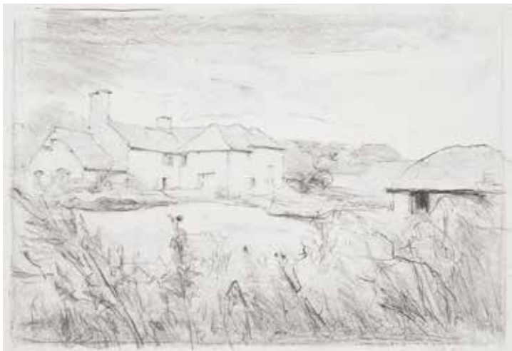
112. Rustington Manor (England's South Coast). Lithograph. 1919. Initialed. 10 1/2 x 14 1/2 inches. [49618c]