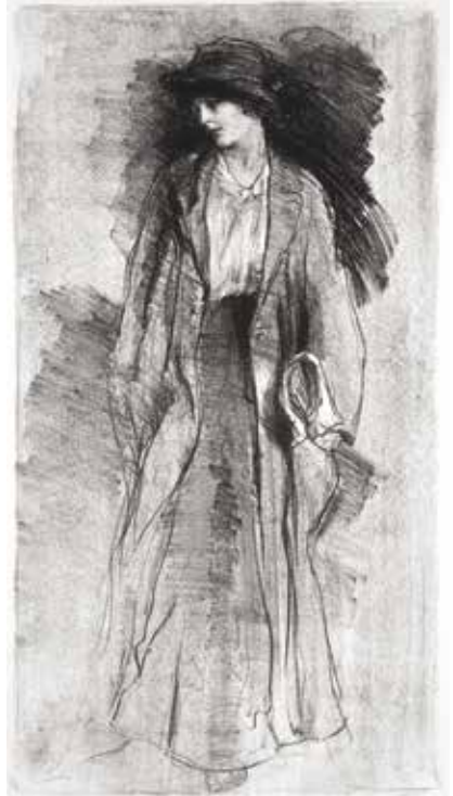
111. Miss Grey . Lithograph. 1915. Signed. 24 x 12 1/2 inches. [48641c]