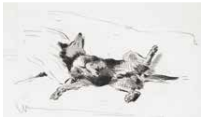
18. Lance at Dunain House on the 8th of October, 1881 . Après nature (drawn from life). Lithograph. 1881. Unsigned. 6 1/2 x 8 1/2 inches. [50171c]