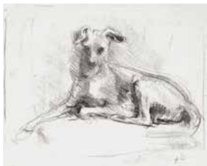
16. Frago . Lithograph. Initialed. 5 x 6 1/4 inches. [50181c]