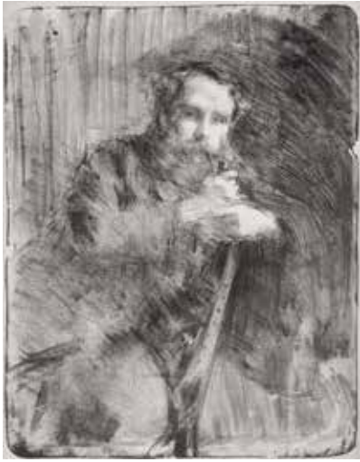
71. Ermenagildo Anglada Camarasa smoking Lithograph. 1909. Signed. 10 x 9 1/2 inches. [49471c]