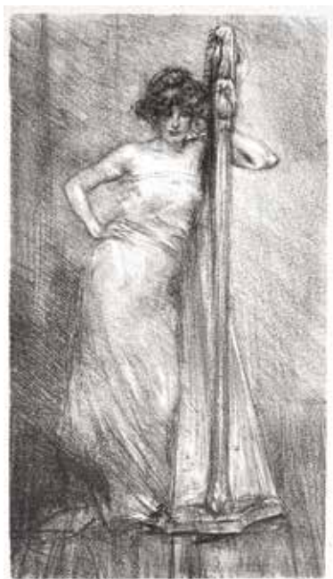
37. Femme à la Harpe . Lithograph. 1906. Signed. 18 1/2 x 10 1/4 inches. [48653c]