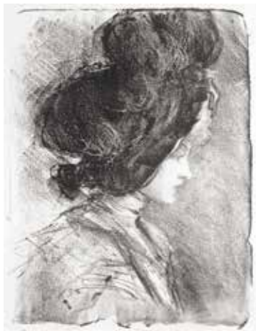
64. Mlle. Manon. Lithograph. 1908. Signed. 8 1/2 x 6 1/4 inches. [50277c]