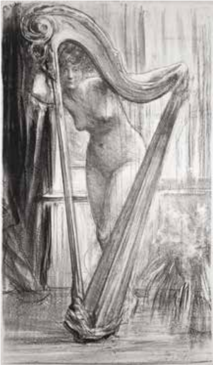
13. Femme à la Harpe (Woman at a harp). Lithograph. 1903. Edition of 12. Signed. 26 x 14 3/4 inches. [48735c]