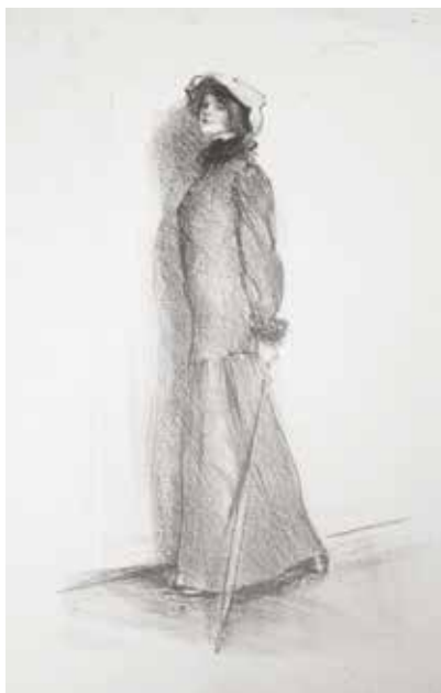
99. Early Morning. Lithograph. 1914. Initialed. 13 1/2 x 7 1/2 inches. [49573c]