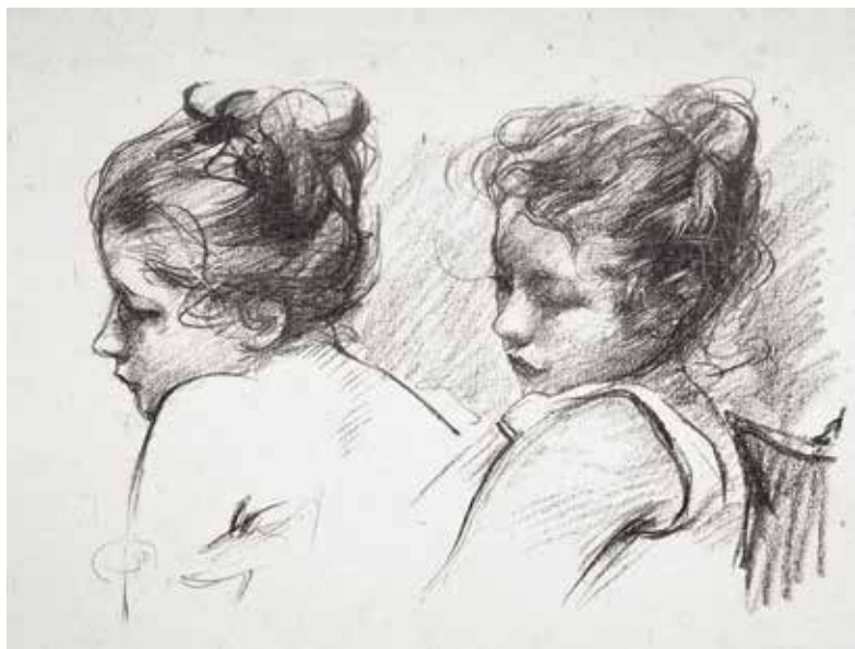
9. Les Petite Filles (The Little Girls). Lithograph. 1901. Edition of 40. Signed. 9 1/2 x 14 1/2 inches.