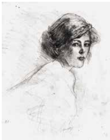
93. Miss Charles. Lithograph. 1914. Signed. 5 x 4 inches. [50805c]