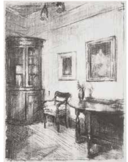
87. Interior Glencairn (Scotland) . Lithograph. 1912. Unsigned. 14 3/4 x 11 inches. [49464c]