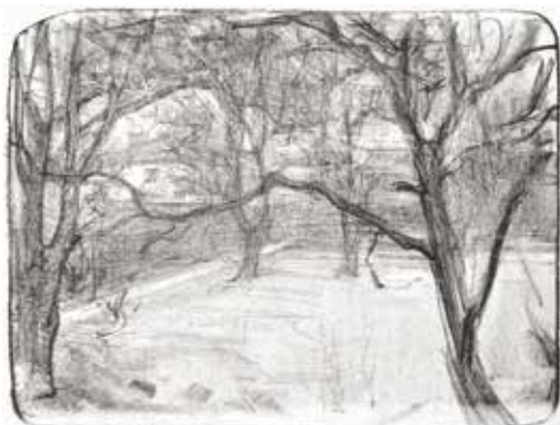
33. Paysage, Ferby Lodge. Lithograph. 1905. Unsigned. 6 1/4 x 8 1/2 inches. [50158c]