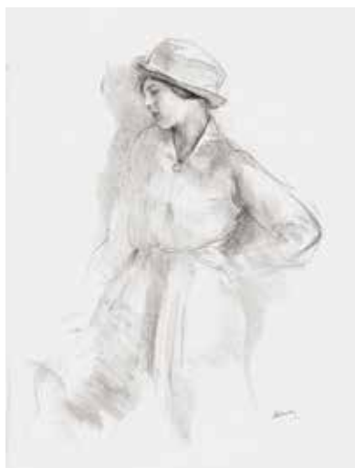
105. The Sporting Girl, Miss Joan . Lithograph. 1917. Signed. 15 x 11 1/2 inches. [49271c]