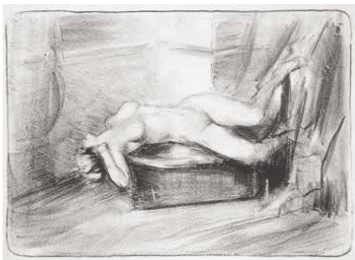
62. Nude . Lithograph. 1909. Signed. 10 1/4 x 14 1/2 inches. [49413c]