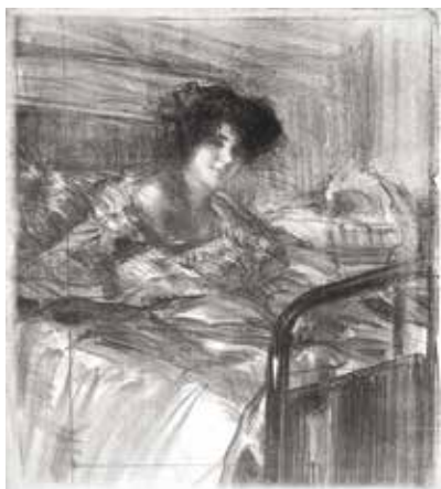
75. Convalescence, Julie de Belleruche. Lithograph. 1911. Signed, Initialed. 19 x 15 1/2 inches. [48648c]