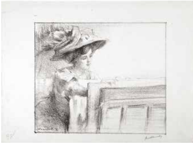
58. Invitation. Lithograph. 1908. Signed. 4 1/2 x 5 1/4 inches. [50199c]