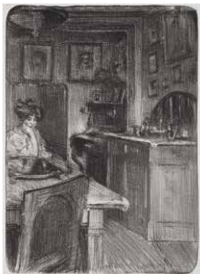
80. Interior, Julie de Belleruche seated . Lithograph. 1916. Unsigned. 14 3/4 x 10 1/2 inches. [49318c]