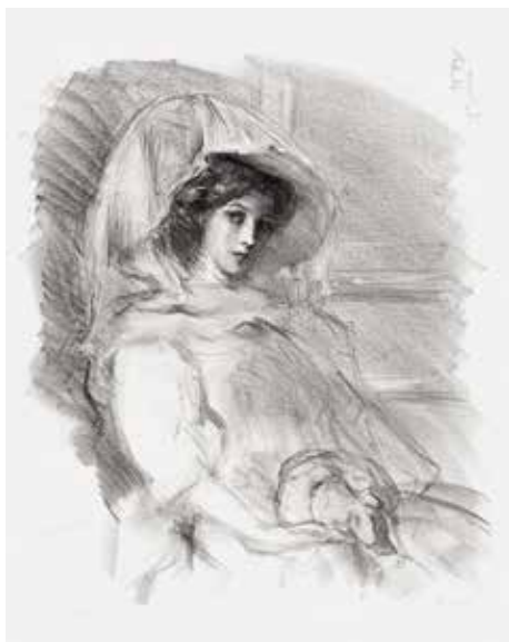
94. Unidentified Sitter. Lithograph. Signed. 20 x 16 1/2 inches. [50851c]