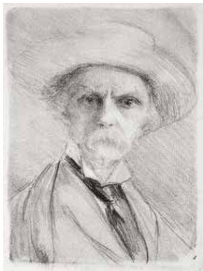
48. Mr. Pollard. Lithograph. 1907. Signed. 8 1/4 x 6 1/4 inches. [50156c]