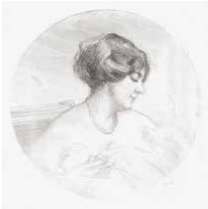
86. Le Collier (necklace), Rose . Lithograph. 1911. Signed. 13 3/4 x 13 3/4 inches. [49500c]