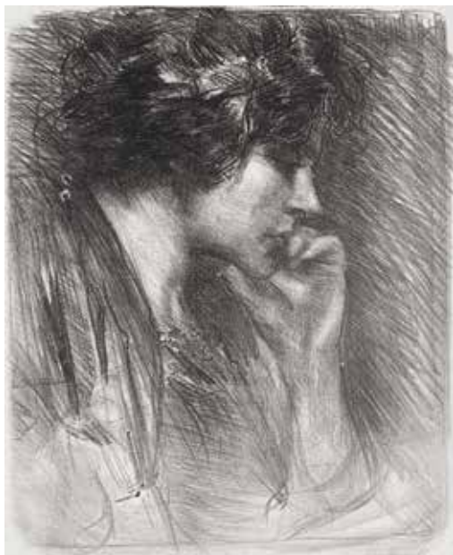
56. Unidentified Sitter. Lithograph. Signed. 16 1/2 x 13 1/2 inches. [49268c]