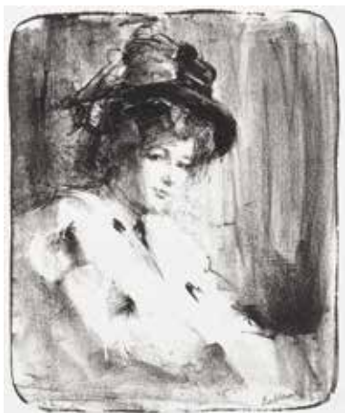
22. Ermin Scarf. Lithograph. 1905. Signed. 5 1/4 x 6 1/4 inches. [49883c]