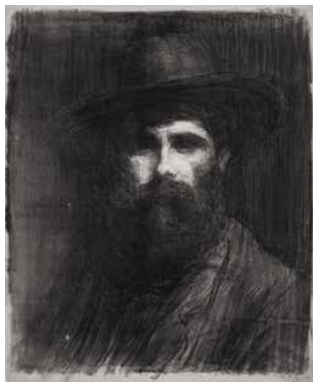
43. Ermenagildo Anglada-Camarosa (1871-1959), painter. Lithograph. 1907. Signed. 22 1/4 x 18 1/2 inches. [48734c]