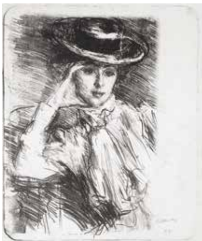
14. La Canotier (Straw hat). Lithograph. 1902. Initialed. Signed. 12 1/2 x 10 1/2 inches. [49255c]