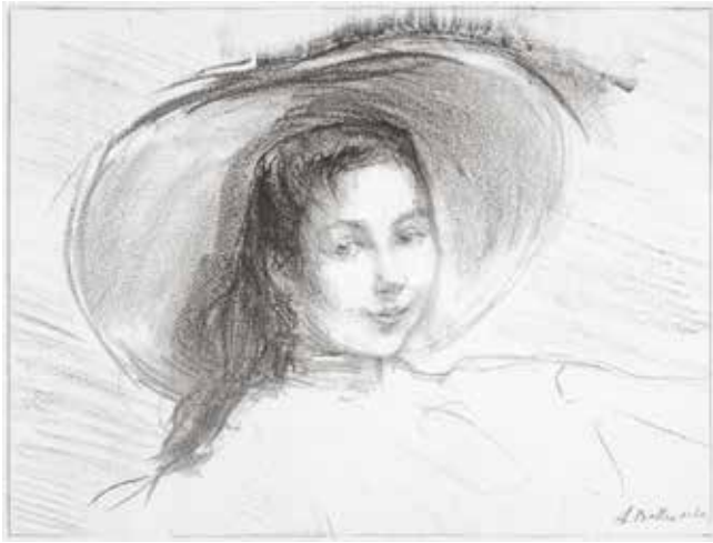
25. Fillette au grand chapeau, Petite Florence (Little girl with a large hat, Petite/little Florence). Lithograph. 1904. Signed. 8 3/4 x 12 3/4 inches. [49275c]