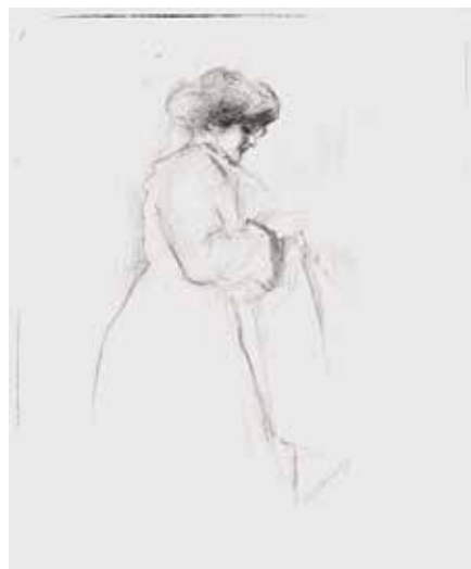
98. Woman Sewing, Dorothy. Lithograph. 1914. Signed. 14 3/4 x 10 1/4 inches. [49548c]