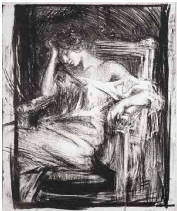
24. Nini, Abandon, Reverie (Nini, lost in a dream). Lithograph. 1903. Signed. 21 1/4 x 17 inches. [48753c]