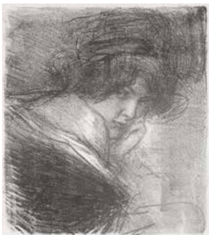
88. Julie de Bellerocche. Lithograph. 1913. Initialed. 9 1/4 x 8 1/4 inches. [49508c]