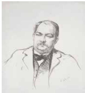
39. Leon Goudio. Lithograph. Signed. 11 x 12 inches. [49440c]