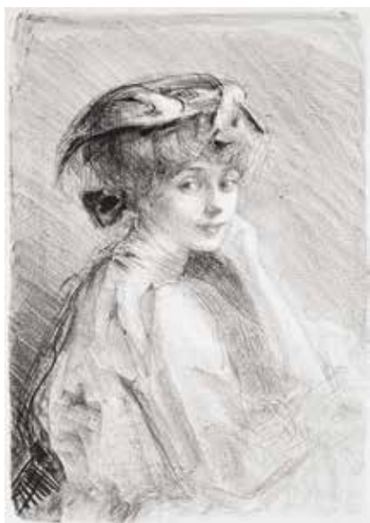
7. La Petite Caroline . Lithograph. 1901. Signed. 13 3/4 x 9 1/2 inches. [49432c]