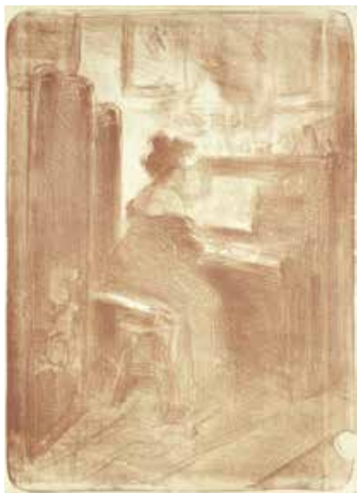
77. Femme au Piano . Lithograph, sepia. 1910. Signed. 14 3/4 x 10 1/2 inches. [49294c]