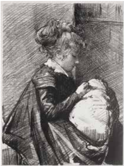
5. La Couseuse (Stitcher). Lithograph. 1901. Signed. 11 x 8 1/4 inches. [49382c]