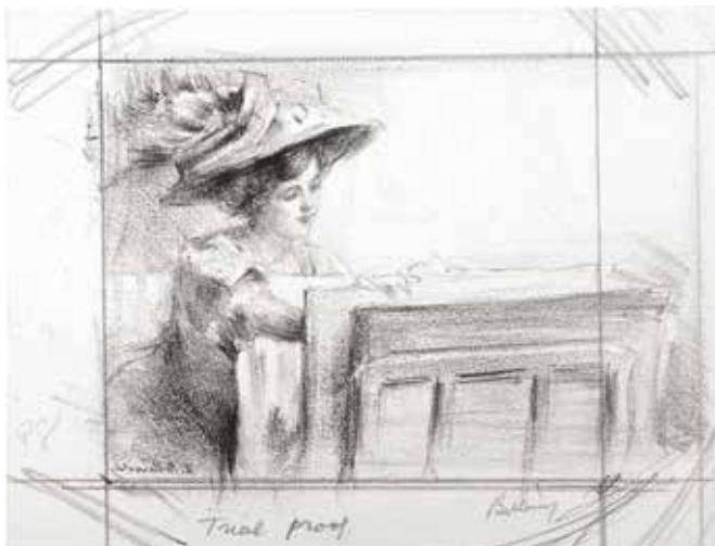
59. Invitation, showing proposed cropping of image. Lithograph. 1908. Signed. 4 1/2 x 5 1/4 inches. [50200c]