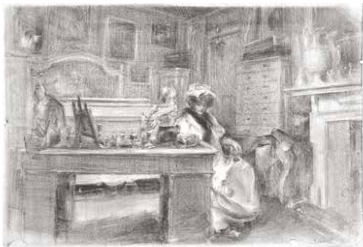
55. Alice Milbank at Ferby Lodge. Lithograph. 1908. Unsigned. 16 x 21 1/2 inches. [48752c]