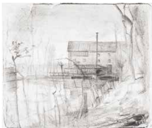
68. La Boissiere (Sawmill), Châteaudun (France) . Lithograph. 1909. Initialed. 10 1/2 x 12 1/2 inches. [49345c]