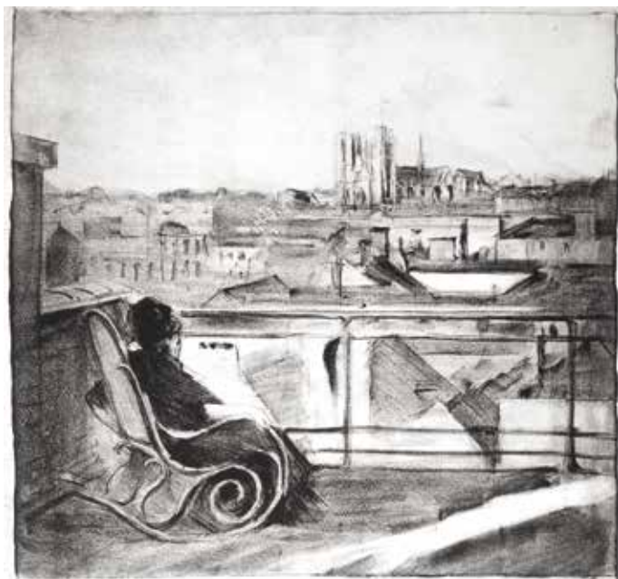
83. Julie de Belleruche at St. Gulule. Lithograph. 1911. Initialed. 15 3/4 x 17 inches. [49341c]