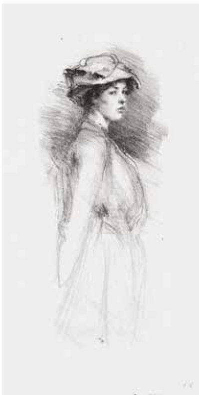
100. Unidentified Sitter. Lithograph. 1912. Initialed. 13 x 5 inches. [49251c]