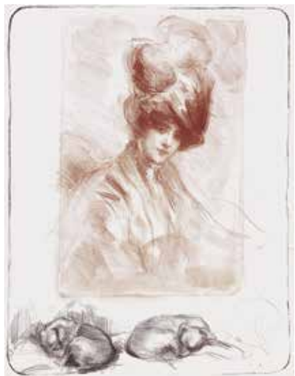
17. Julie de Belleroche, Frago (2 remarques below). Lithograph, black & sepia ink. 1910. Signed. 19 x 15 inches. [48620c]