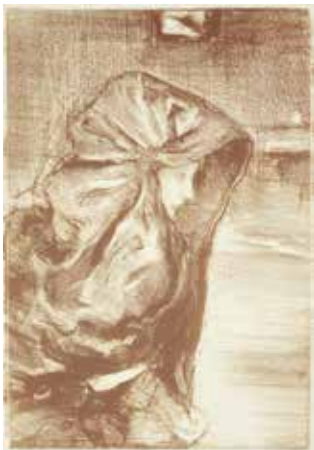
63. Cape Maltese. Lithograph, sepia. 1909. Initialed. 10 1/2 x 7 1/4 inches. [49423c]