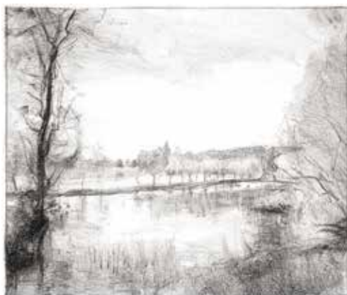
69. Châteaudun, Eure-et-Loir . Lithograph. 1909. Signed. 9 x 10 1/2 inches. [50166c]