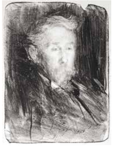
72. Joseph Pennell, the artist. Lithograph. 1909. Unsigned. 8 1/2 x 6 1/4 inches. [50157c]