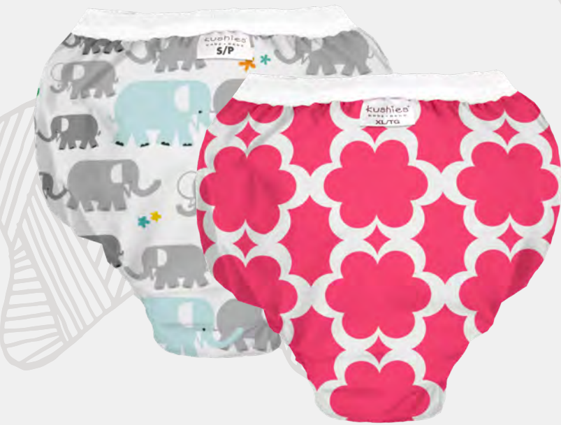
Lightweight Taffeta Pull On Training Pants