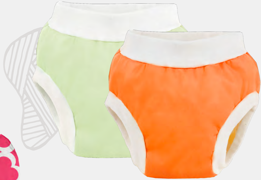
Pull On Training Pants

Waterproof outer layer. Double layer of soaker.