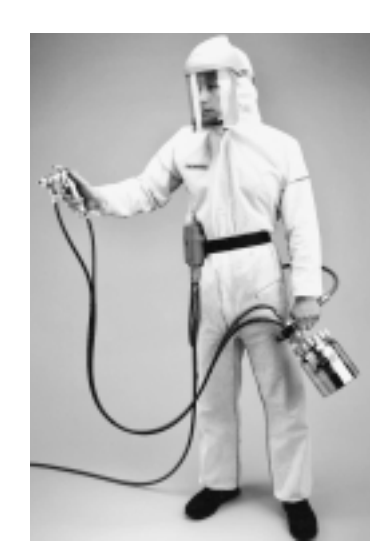
THE KBII REMOTE CUP OPERATES FROM A SINGLE SUPPLY LINE TO GIVE GREATER MANOEUVRABILITY WHEN WORKING IN DIFFICULT AND RESTRICTIVE AREAS