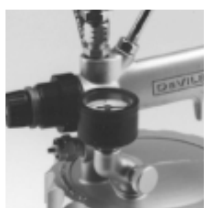
AN ADJUSTABLE SELF RELIEVING REGULATOR IS PROTECTED BY A SOLVENT RESISTANT CHECK VALVE TO PREVENT PAINT CLOGGING.