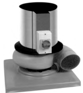
Plastec 35 with Roof Unit Kit