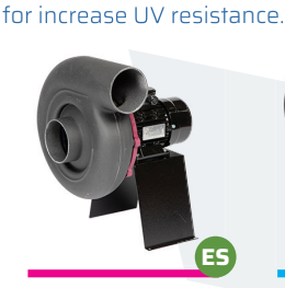
STORM 14 Air flow rate: 235 to 765 CFM P max: 1.5 to 7.25 in.w.g.